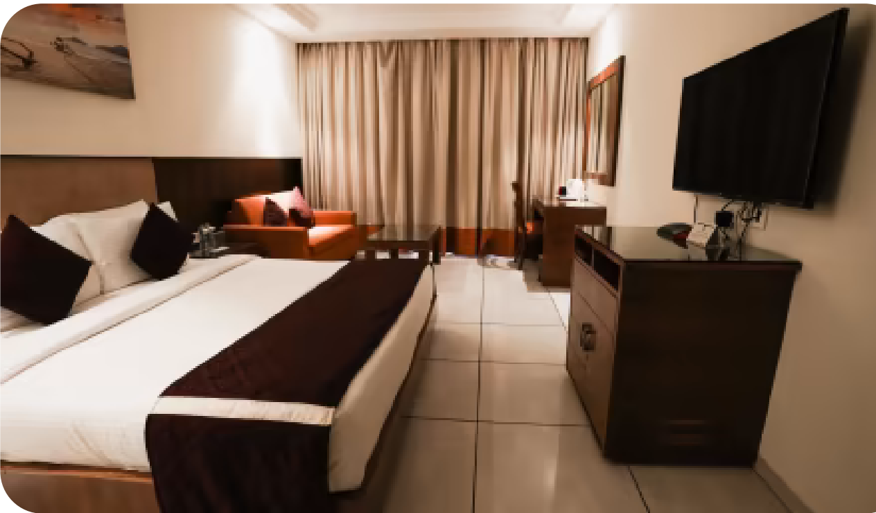
Super Deluxe Room 299 Sq. ft.