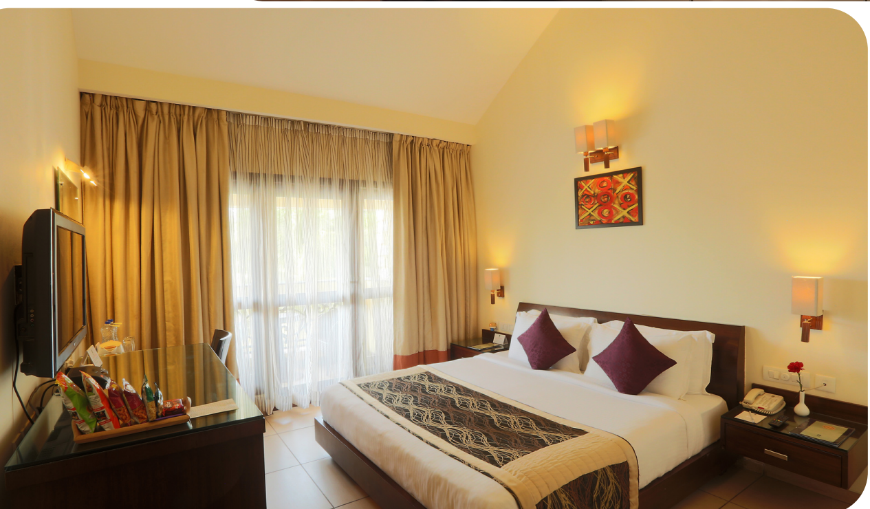
Deluxe Room 255 Sq. ft.