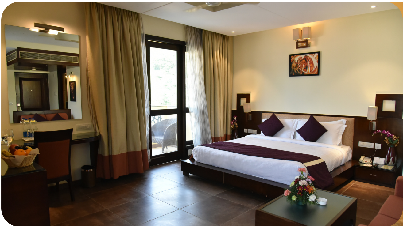
Suite Room with bathtub

Set amidst the tranquil Calangute Beach in Goa is our Resort De Coracao-Calangute. Adding more joy and fun to a place known for its adventure and nightlife, a stay at our resort will provide the complete package. Treat yourself to the delicious seafood specialties served at our in-house restaurant and enjoy the modern facilities like the swimming pool, fitness centre and much more during your stay.