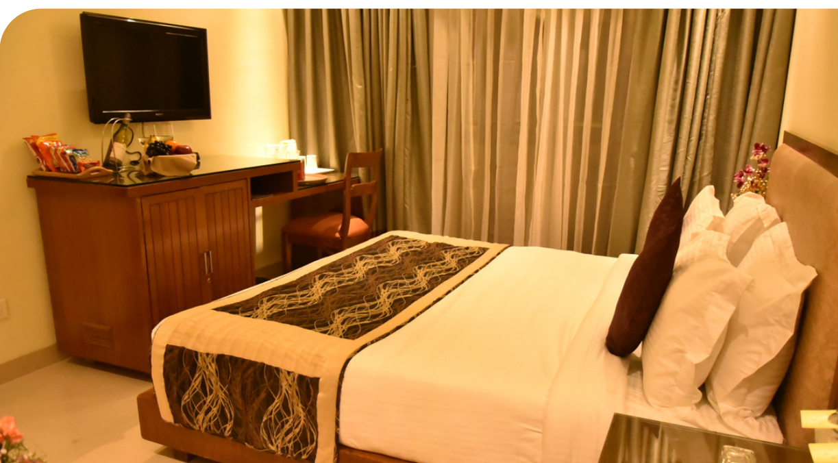
Superior Room 224 Sq. ft.