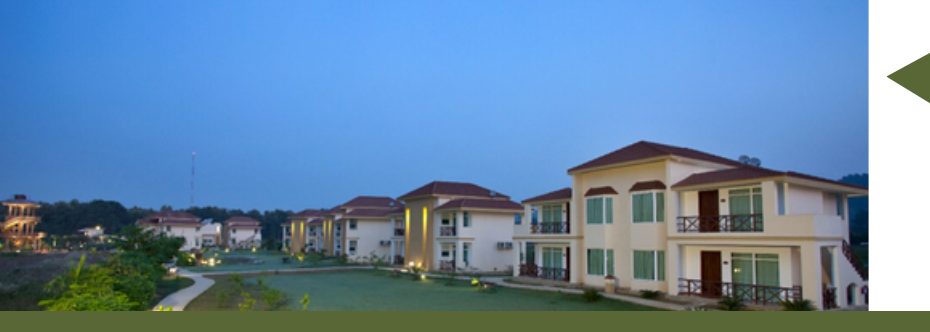
Dove Garden Size - 1560 Sq.Yard Gathering upto 100 pax

Swan Garden Size - 1100 Sq.Yard Gathering upto 100 pax